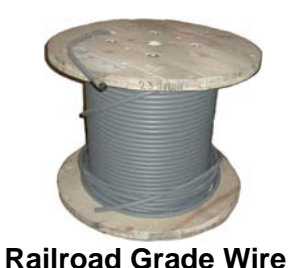
Head End Power Parts