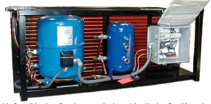
Air Conditioning Condensers designed for Under-Car Mounting, Copper Coils for Best Survival in Railroad Environment, and Wide Fin Spacing for Easier Cleaning. NOT A MODIFIED building unit!