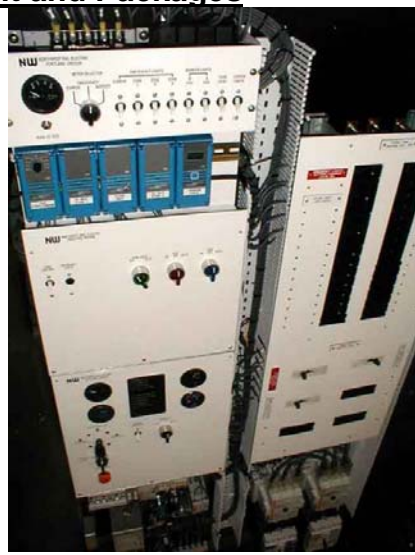
HVAC Control, Circuit Breakers, Generator Auto-Start, DC System Control, and Power Selection