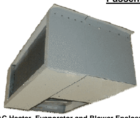
HVAC Heater, Evaporator and Blower Enclosures Standard Units fit most Passenger Cars. Custom Units Built to Order for Special Cases, including Stainless Steel for Diners.