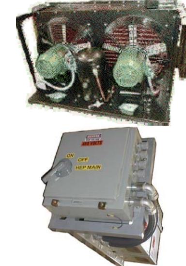
Various Custom Equipment (Condenser and Under-Car Transformer Shown)