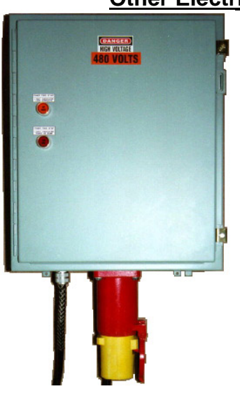
Yard Power Units, in 200 Amp, 400 amp, and 800 Amp, various configurations for various needs